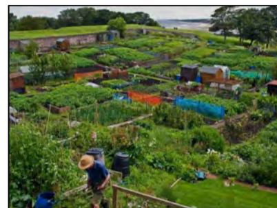
Allotments and Community Orchard