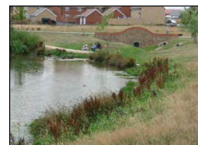
Water Retention / Attenuation Ponds