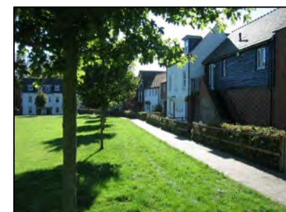
Formal Avenues of trees