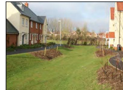
Informal Grass Swalls