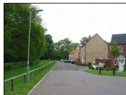
Formal / Informal Landscape Elements