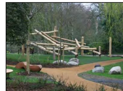
Imaginative Play Opportunities