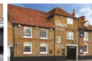
THE SWAN HOTEL