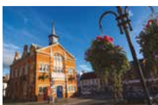
THAME TOWN HALL