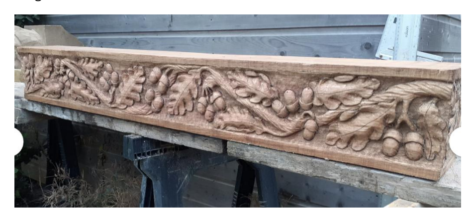
Engraved Oak Beam