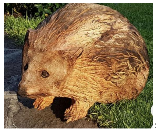
Small Oak Animal Carving