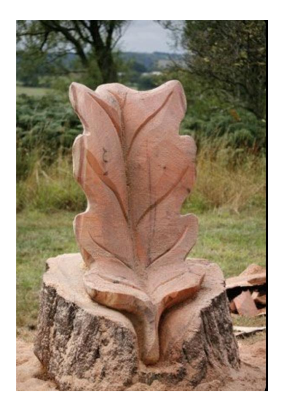
Oak Chainsaw Carving