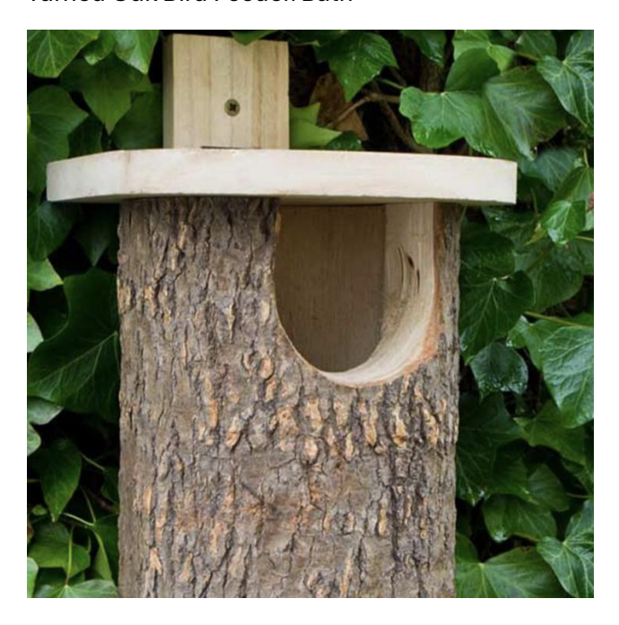
Rustic Oak Bird Box