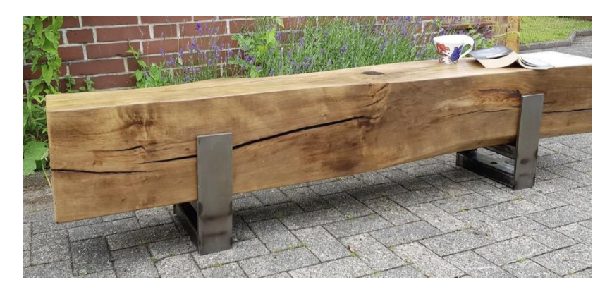
Large Oak Beam Bench