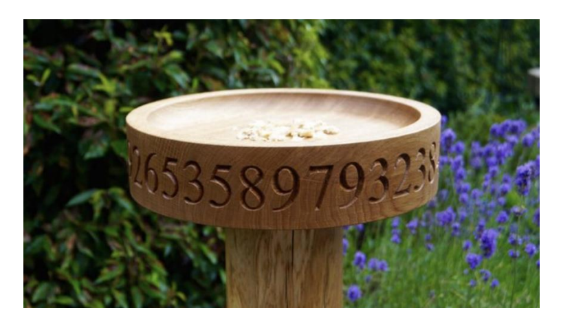
Turned Oak Bird Feeder/Bath

makers and crafters. I have some thoughts and ideas that are not demonstrated here and would be keen to develop them further in conjunction with the Town Council.