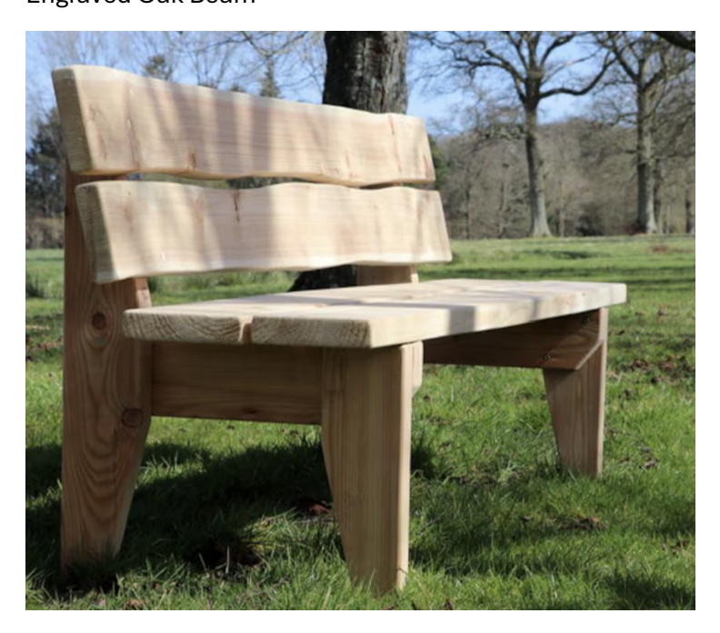
Rustic Oak Park Bench