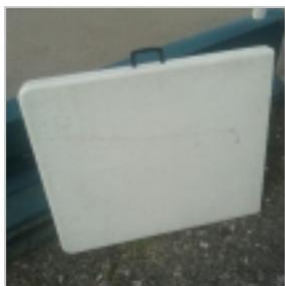
Tables and Chairs